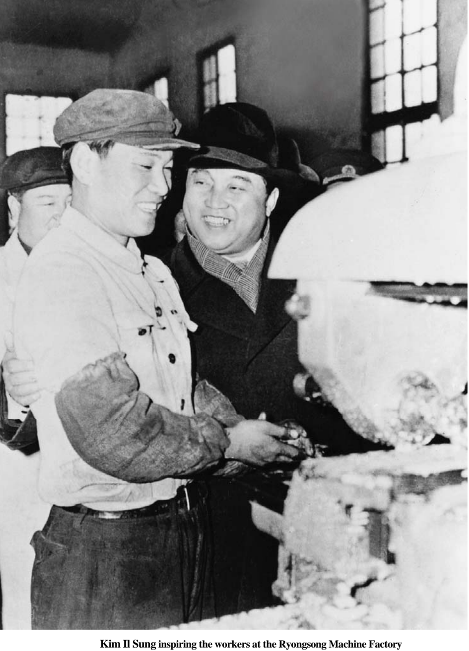
to labour feats (March 1959)