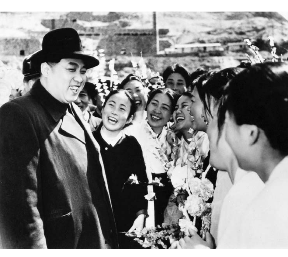
Kim Il Sung among the workers (April 1961)