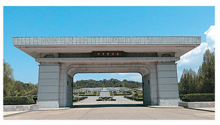
Archway to the Patriotic Martyrs Cemetery