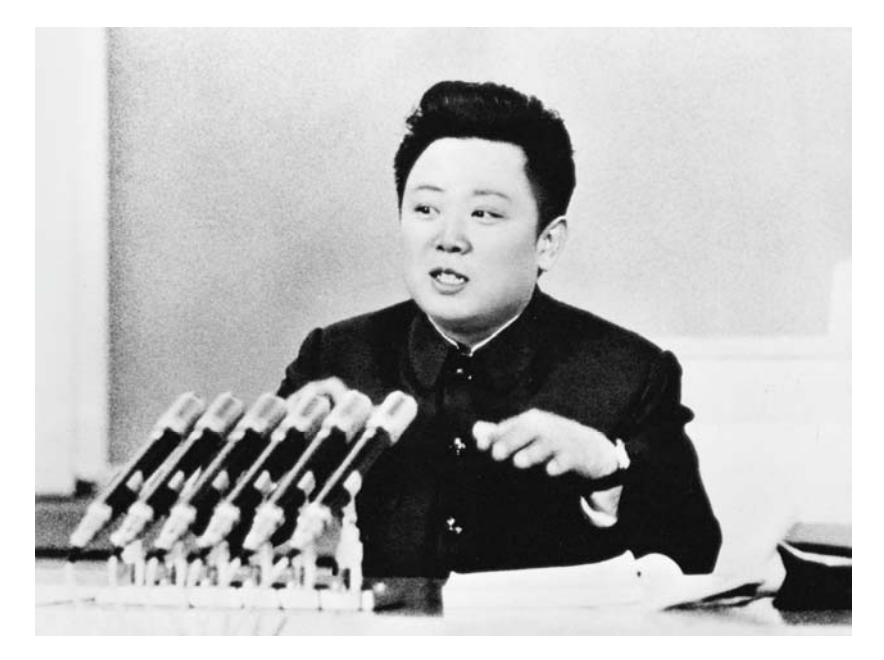
Kim Jong II concluding the National Training Course for Party Information Workers (February 19, 1974)