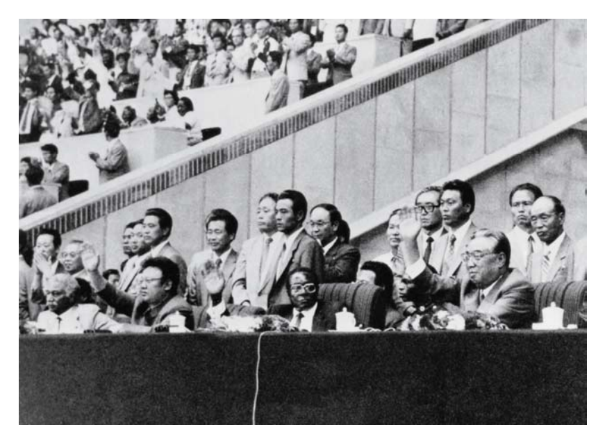
Kim Jong II, in company with Kim II Sung, at the opening ceremony of the 13<sup>th</sup> WFYS (July 1, 1989)