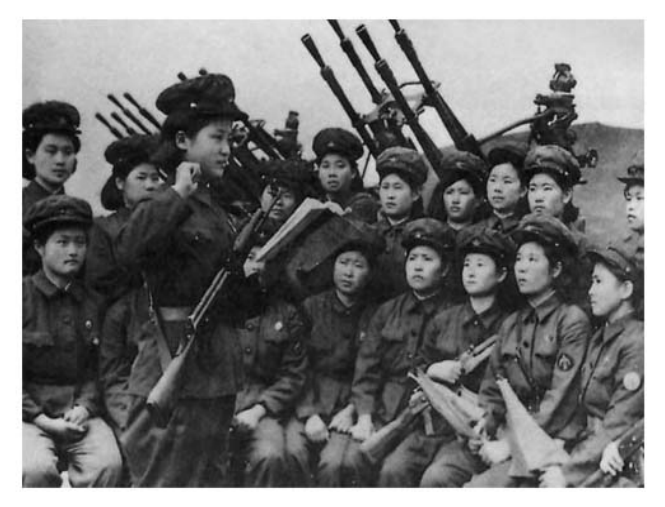
Women AA machine gunners of the Worker-Peasant Red Guards