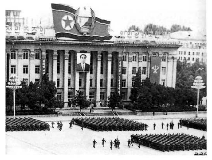
The parade held in Pyongyang on July 27, 1993