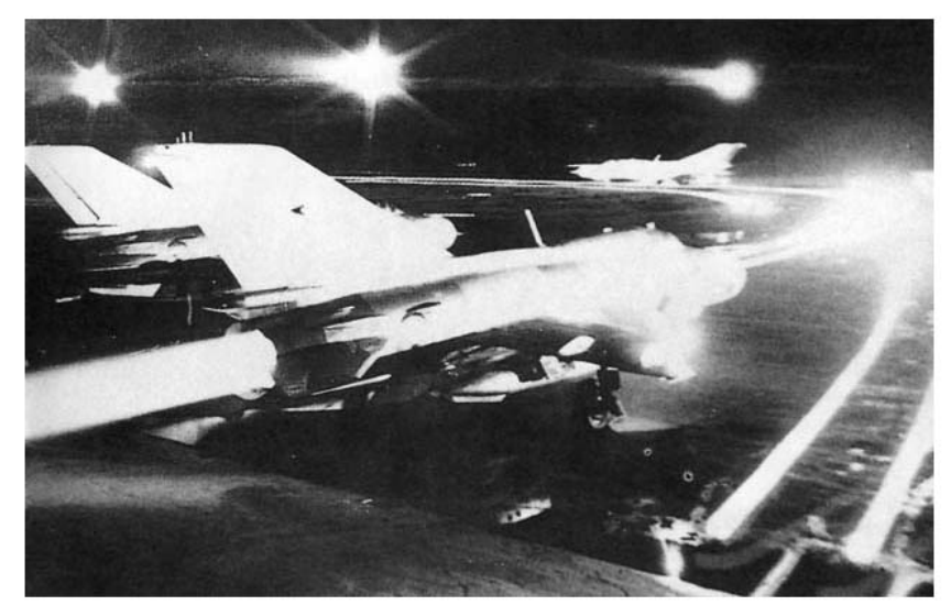
Night exercise in an air force base