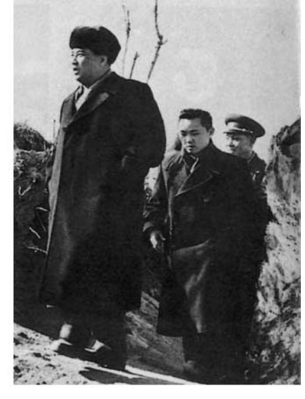
Kim Jong II visits a front line unit of the KPA with Kim II Sung.