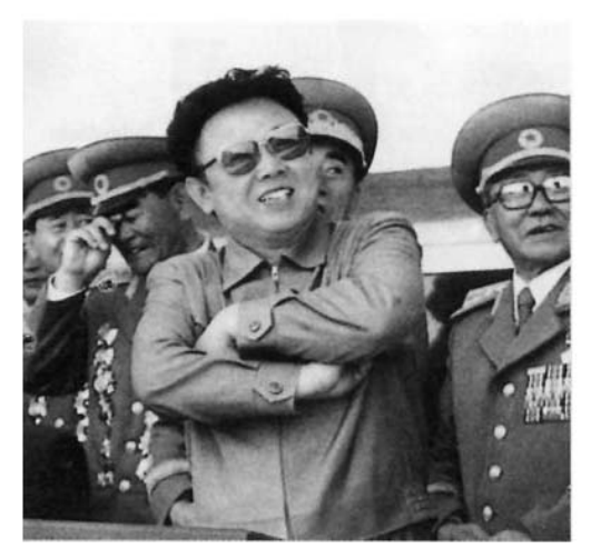
Kim Jong II inspects a firing practice of a rocket-launcher unit.